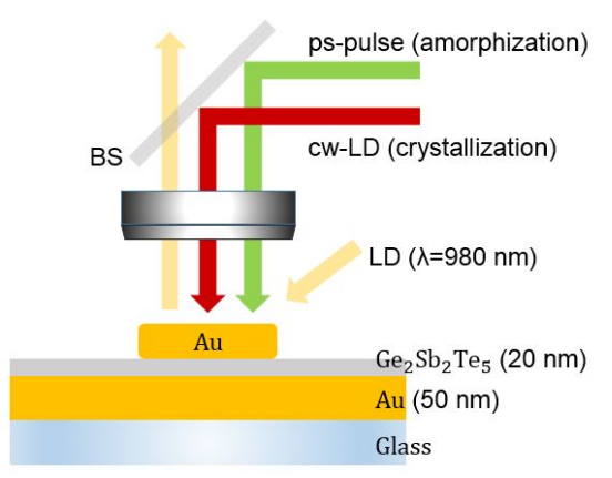
Fig. 1. Schematic diagram of the sample structure and experimental setup for dark-field scattering measurements.

After deposition of a Au thin film with a thickness of 50 nm on a glass substrate, a 20 nm GST film was formed by sputtering. A colloidal solution of AuNRs (140 nm long, 50 nm diameter) was used; the AuNR dispersion in ethanol solution was drop-cast onto the GST film. The substrate was heated to rapidly evaporate the ethanol and prevent the aggregation of AuNRs.